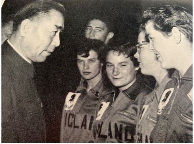
Judy meeting the Chinese Premier Chou en Lei

announced her retirement. The following morning the Daily Express announced that she had joined their staff as a trainee journalist to cover swimming. She also visited schools who had built swimming pools and developed a brand of swimwear for children. She appeared on Desert Island Discs with Roy Plumley in 1959 and published her autobiography 'Water Babe' in 1960.