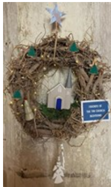
Little Fawns Pre School

Due to its success and popularity with the local community, we will continue to hold a Christmas Wreath Festival biennially; the next Christmas Wreath Festival will therefore be held in December 2026.... plenty of time to think up some exciting and creative wreaths!!