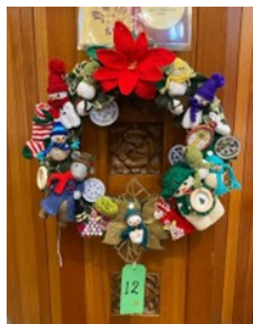
St Lawrence Craft and Conversation Group